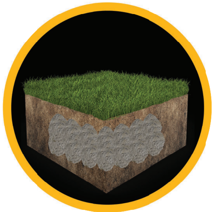
Sinkhole in Field